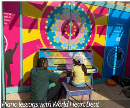
Piano lessons with World Heart Beat

From leading musicians, to renowned artists and local poets, it has all been happening, as we look now to a different take on Christmas with a free programme to entertain, join in and just enjoy. See next page for details.