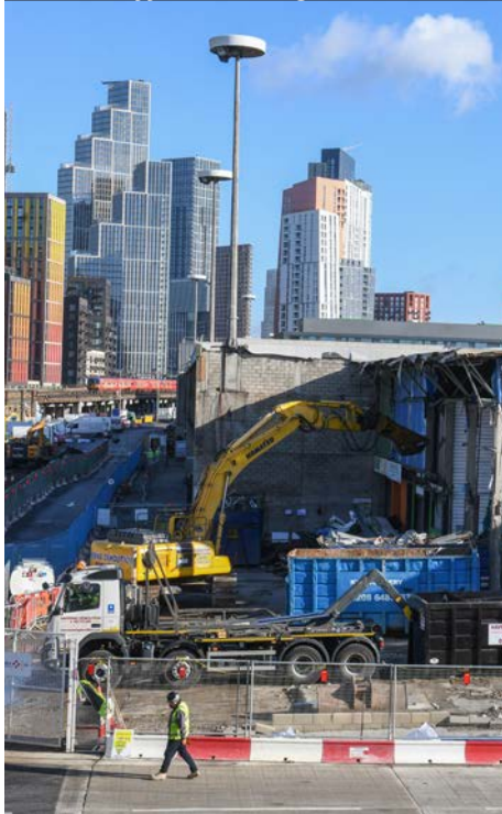
Demolition of first section begins

If you have any queries or concerns about works on site, please contact: