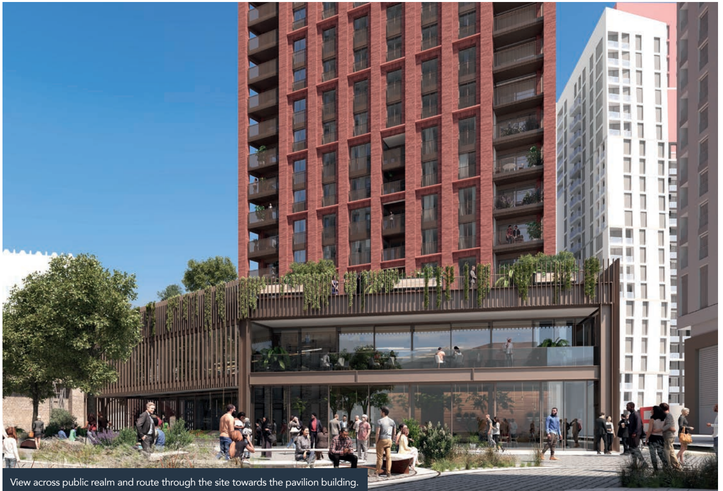
View across public realm and route through the site towards the pavilion building.