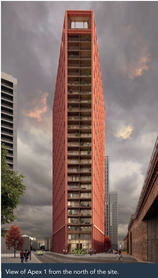
View of Apex 1 from the north of the site.

Apex 1 forms part of the wider Masterplan for the New Covent Market site, which will eventually deliver a new Fruit and Veg and Flower Market, 3,000 new homes, retail and commercial space, and attractive public realm.